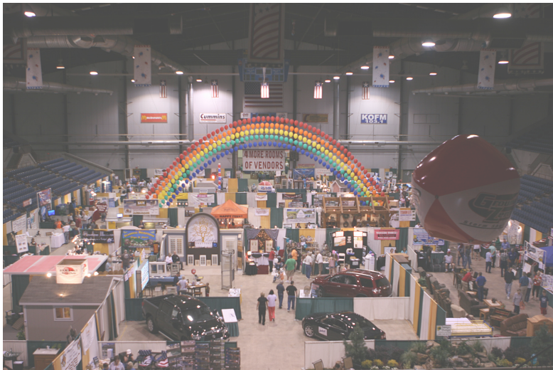
The Coliseum is just one of five rooms to choose from at the Enid Home Builder's Home Show.