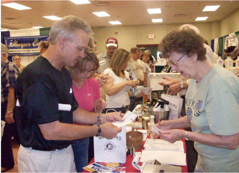
From services to cash-and-carry items our vendors meet the needs of the consumer.